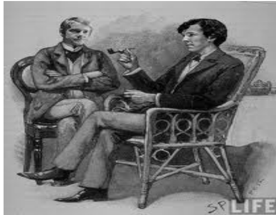
COULD BE NEW AGAIN